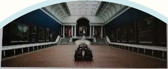
Art Gallery Treasure Hunt