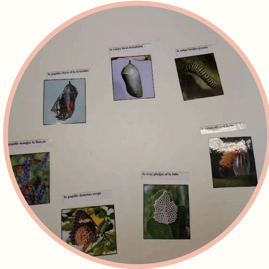
Science: the life cycle of a butterfly