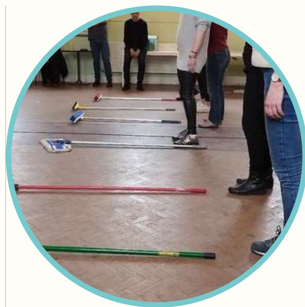
Irish dance class